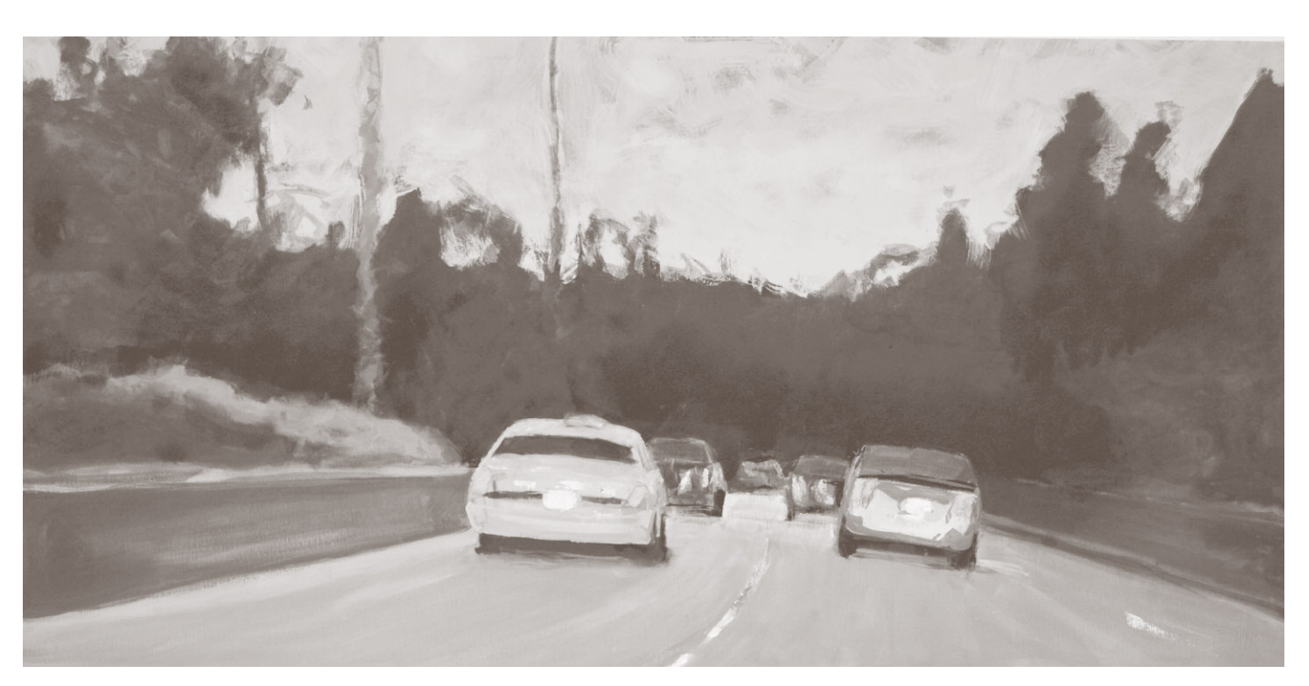
Rush. 2010. Richard Willson, Oil on canvas, original in full color, 48" x 24"

Third, freeway driving reveals an aesthetic of cooperation . While media attention focuses on driver discourtesy, competition, and road rage, clear-eyed observation of driver behavior reveals that cooperation and courtesy dominate the experience. Without enforcement present, drivers let others merge into their lanes, take turns merging, pull over to assist others, and move out of the passing lane if driving slowly. The freeway system could not function without this cooperation. Drivers participate in a dance, generating a communal choreography as they go. Of course there are exceptions, but courtesy and altruism rule the day.