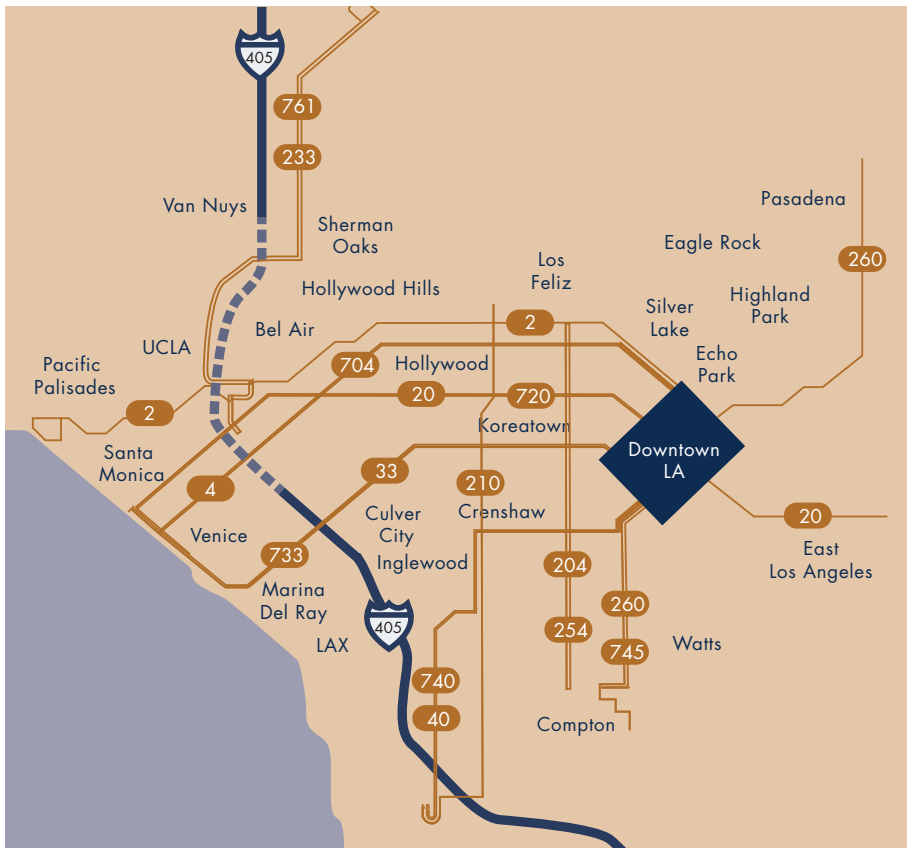
FIGURE 2 Carmageddon Bus Routes Analyzed

Although the first closure was scheduled to run from Friday evening through early Monday morning, the work proceeded more quickly than expected, and the actual closure ended mid-day Sunday morning, about 15 hours early. The second closure ended an hour earlier than scheduled, early on Monday morning.