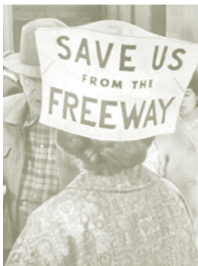
Citizens protesting the Central Freeway in 1966 (left); it was demolished in 2003 (above). The new freeway ramp leading to Octavia Boulevard (right).