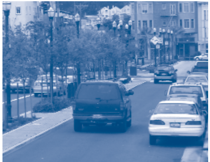
Too-wide side access roadways

The design process is important. The right people must be sitting around the table on a regular basis. Problems and con-