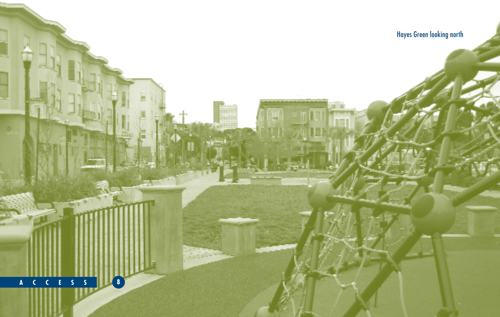
Hayes Green looking north

It took the efforts of many people to get Octavia Boulevard built, but without a doubt local citizen activists really made the project happen. A group of concerned residents met continually, addressing problems and envisioning potential solutions even before the 1989 earthquake, and pushed for something better than they had. City bureaucrats were instrumental as well, particularly traffic professionals from the Departments of Parking and Traffic and Public Works. Each had to give a little and bend long-standing norms to help reach compromises. In the end, the Public Works Department prepared the construction drawings and saw Octavia Boulevard and Hayes Green through to completion.