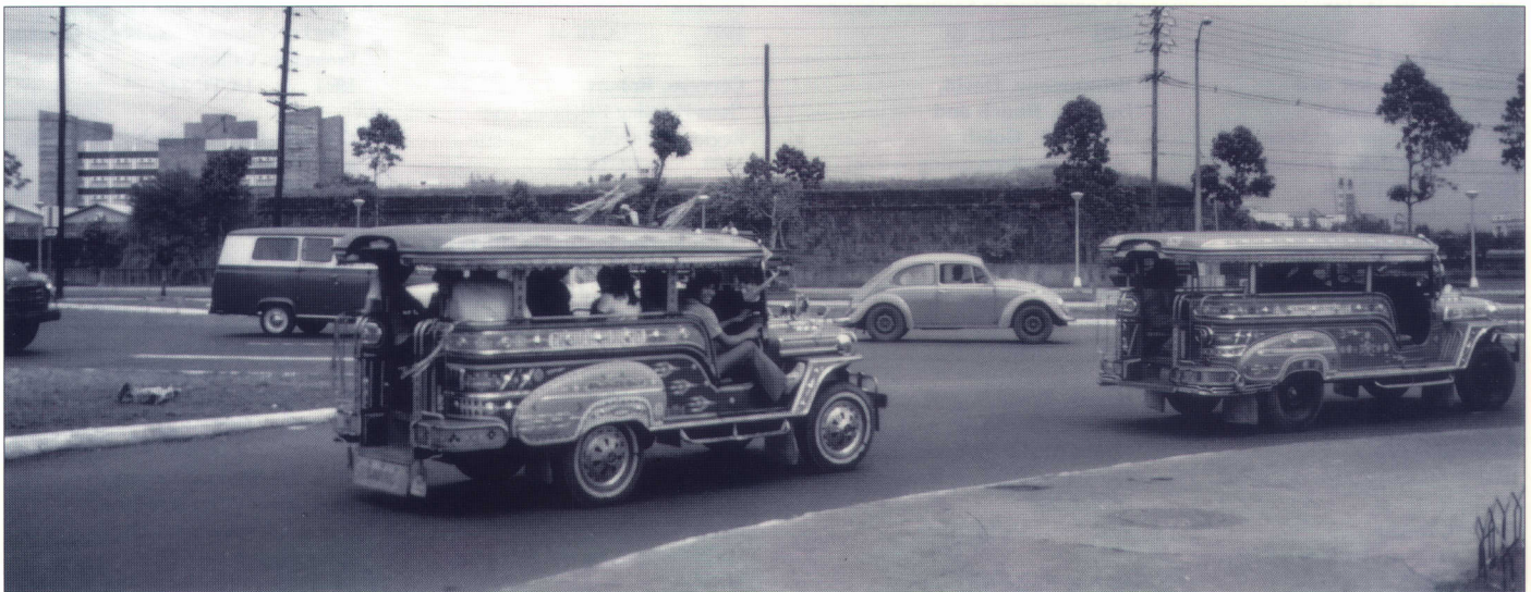
Jeepneys on the road in Manila