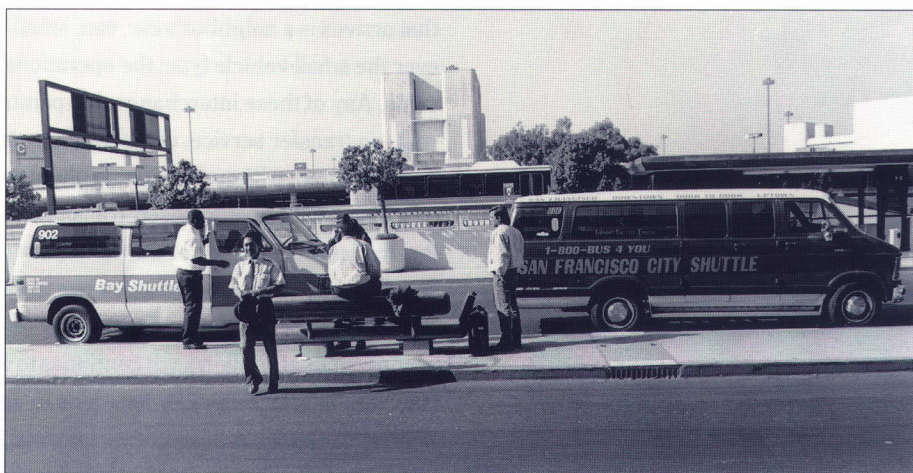
Jitneys waiting at San Francisco International Airport.

In addition to creating incentives for voluntary ridesharing, improvements must be made in more formal public transit systems. Because the contemporary suburban pattern consists of dispersed origins and destinations, the most promising strategies for public transit are those