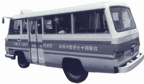
Hong Kong public light bus

that arrives is a neighbor's car, van, small bus, or taxi, is probably inconsequential; whatever the small-vehicle type, the operational service characteristics are approximately the same. Any of these interchangeable paratransit vehicles can provide door-to-door, short-wait, no-transfer service, comparable to the level of service that a private car provides—and, for some, without the hassle and costs of parking.