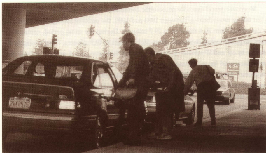
Strangers joining carpools to cross the San Francisco Bay Bridge. An official sign (left) marks what began as an informal gathering place.