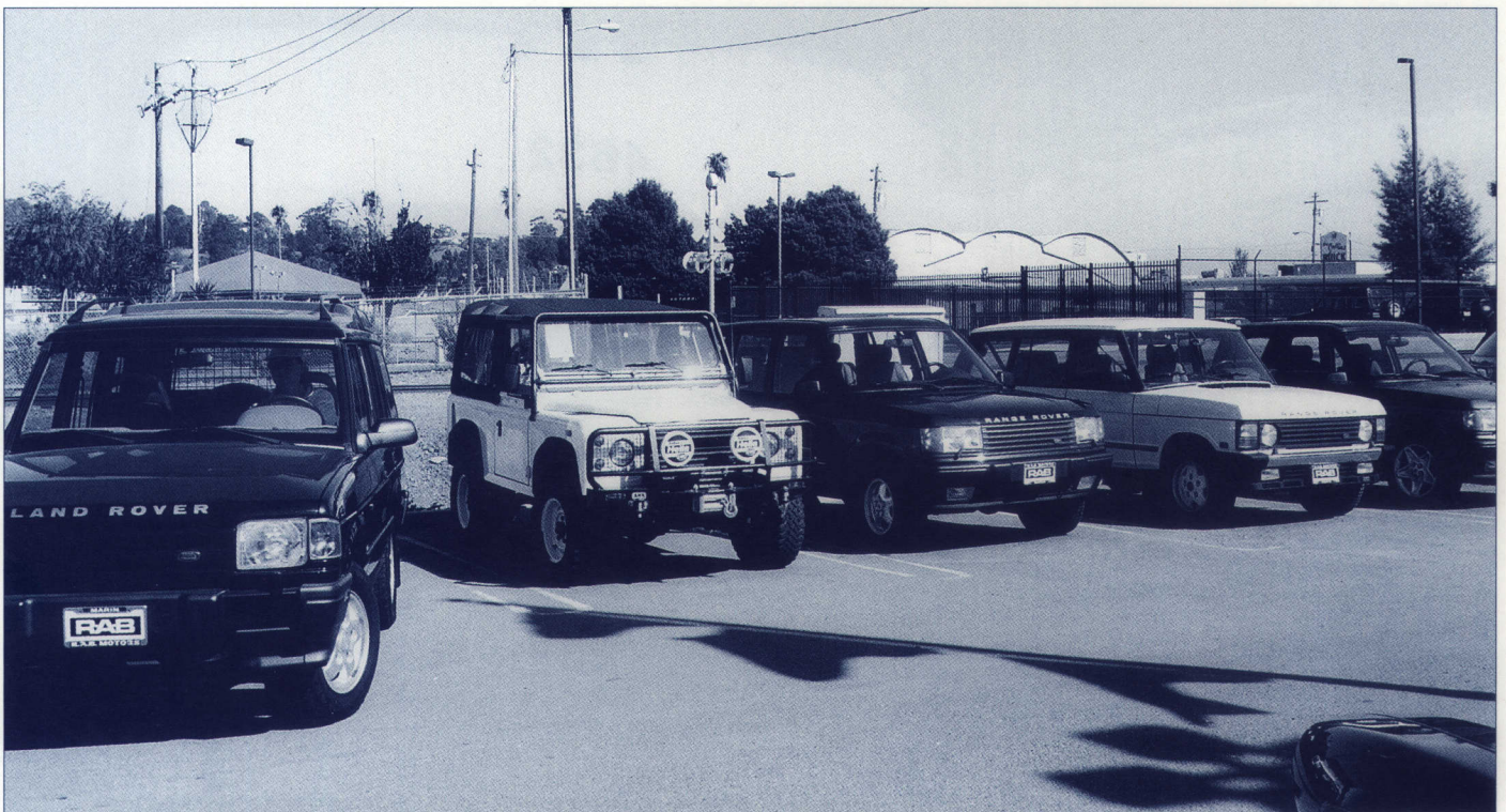
Invasion of the SUVs.

Concerns about energy use no longer reflect fears of oil depletion or energy dependence (though that may change in the coming decade). Instead, we're concerned about climate change and the greenhouse gases that cause it. About 25 percent of all human-generated greenhouse gases come from transportation, over half of that from light-duty vehicles. Unlike air pollutants, greenhouse gases from vehicles cannot be reduced easily or inexpensively with add-on control devices. The relationship between gasoline consumption and CO 2 emissions is fixed. CO 2 emissions may be reduced by improving fuel