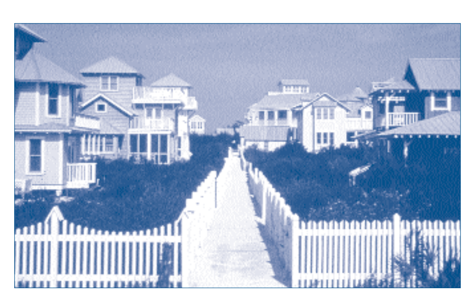
Picket fences and front porches mark Seaside, Florida

Empirical studies, in contrast, can't assume away behavior. They must explain it. The research strategy in most empirical analyses is to search for correlations among neighborhood features and observed travel—sometimes controlling for other relevant factors, sometimes not. Even then, Susan Handy and others report that outcomes are