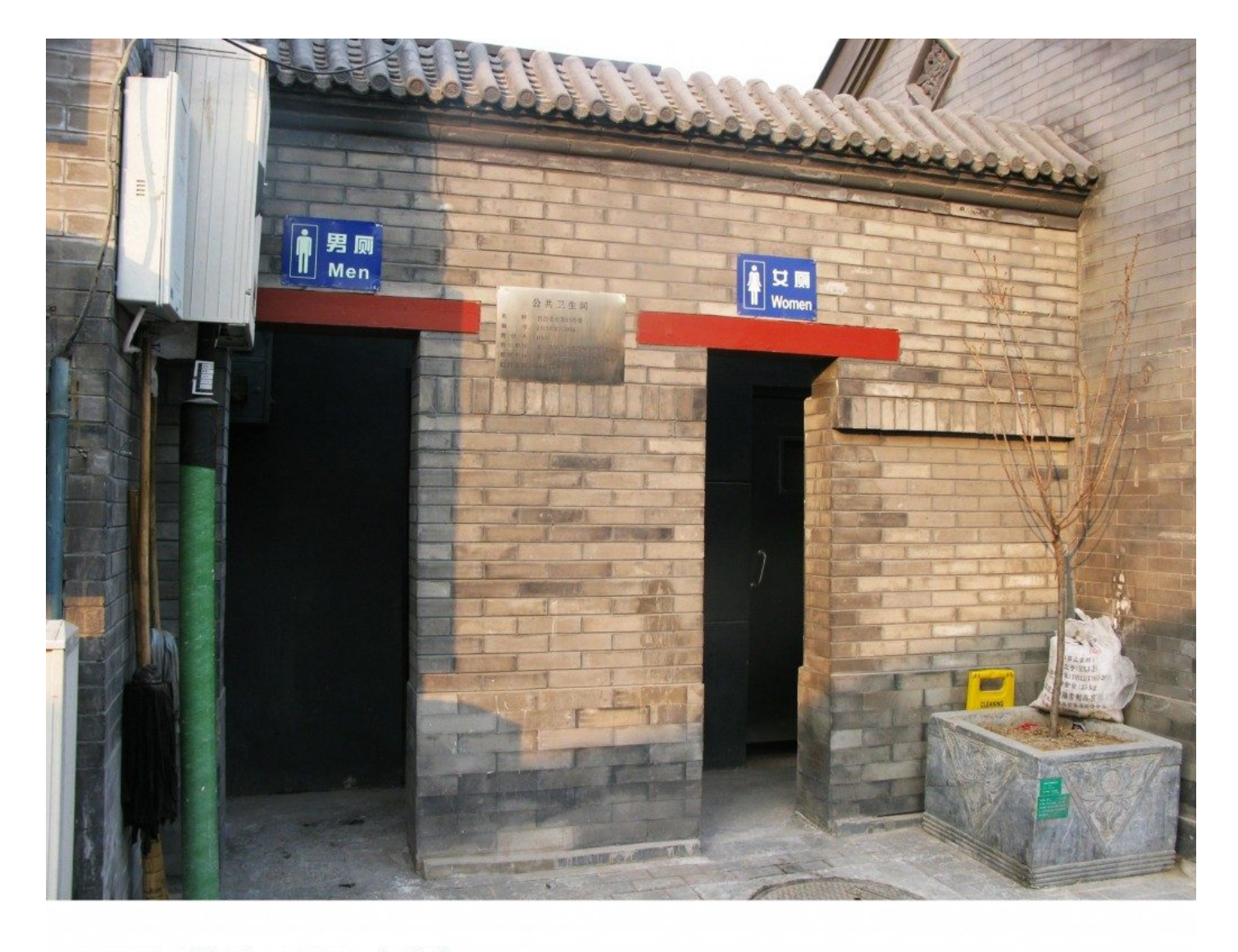
Figure 4. Public Toliet in XiSi North 6th Alley