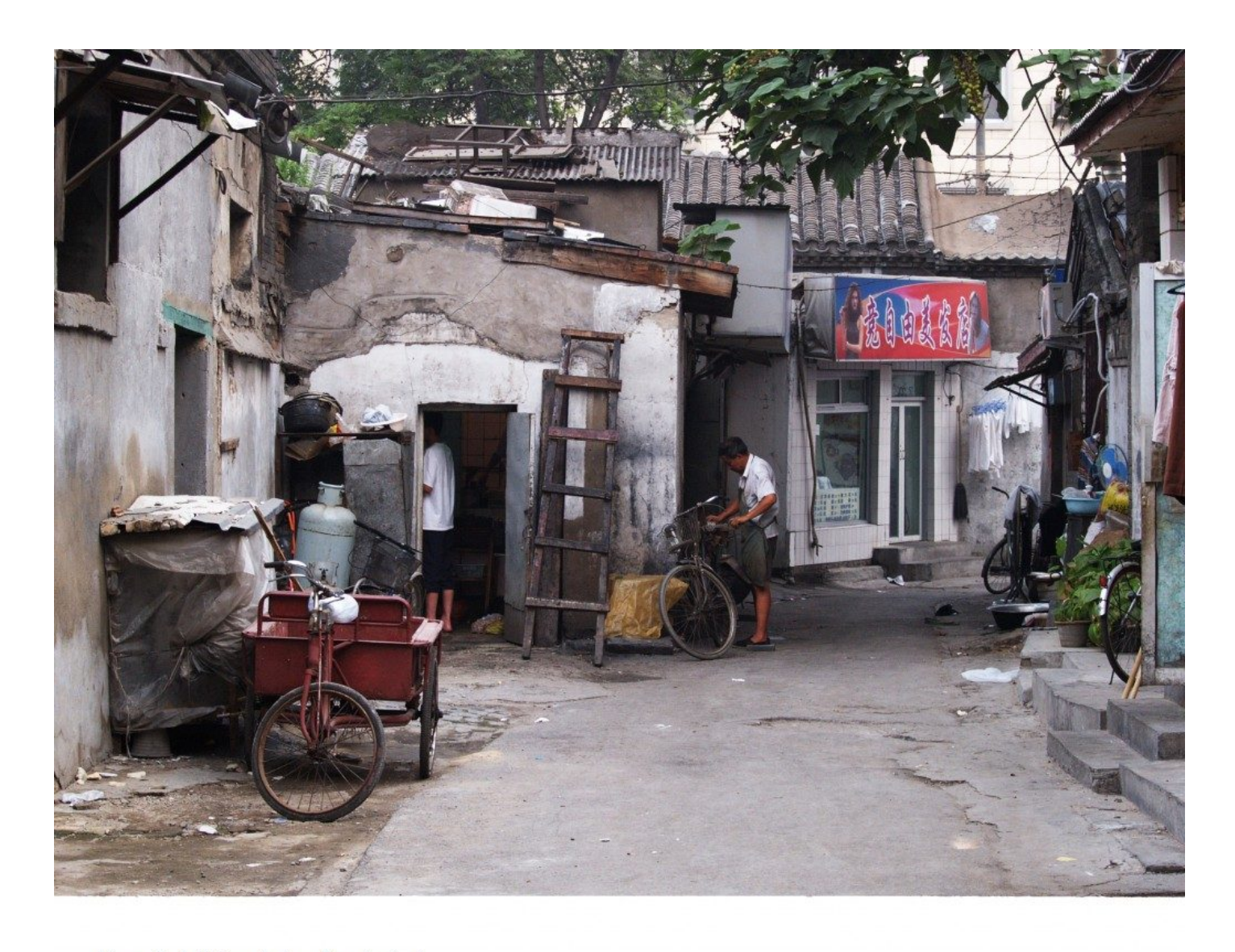
Figure 1. A Hutong before Cars Arrived