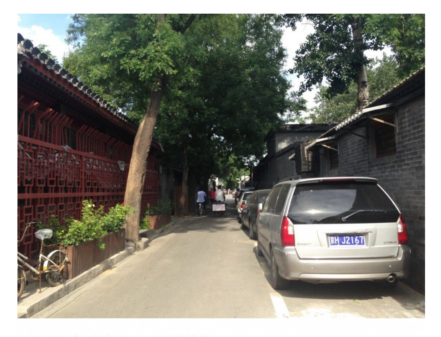
Figure 3. Regularized Parking Spaces in XiSi North 7th Alley

The pilot program also improves public services. Government employees clean the public toilets (Figure 4). Surveillance cameras and 24-hour patrol officers increase security. Private firms provide other services, including street cleaning, trash collection, and landscape maintenance.